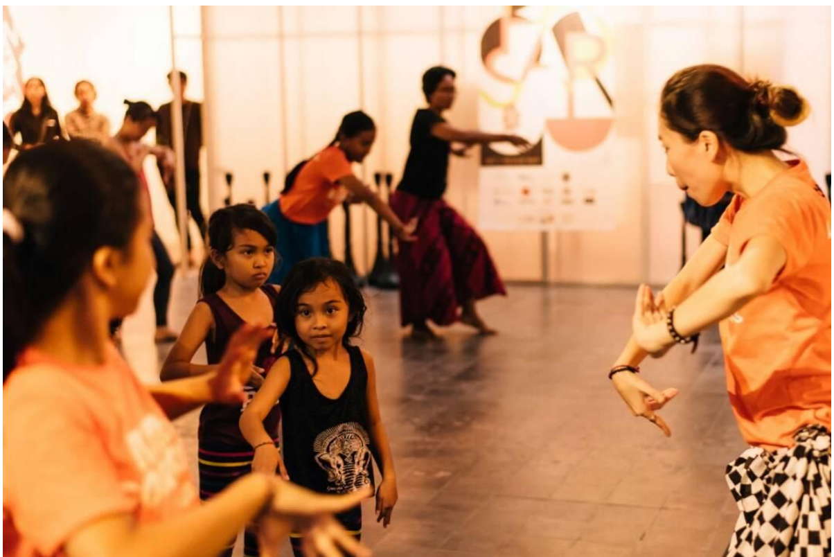
Image: DenPasar Contemporary Dance Workshop as part of DenPasar2017 series of events featured KITAPOLENG and Bali Deaf Community.